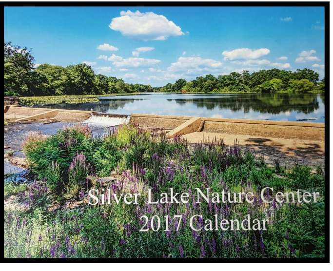
All proceeds benefit the Friends of Silver Lake Nature Center