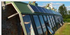
* pending county approval

If you haven't already signed on to volunteer, please do so by contacting the Nature Center. This will be a wonderful hands-on opportunity to learn about sustainable architecture.