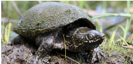
Sternotherus odoratus, Eastern Musk Turtle

Other canoes from our group started to drift over to us and one inquisitive young boy asked, "How did it jump into your canoe?" I explained - the stinkpot turtle does something that no other turtle in Pennsylvania is known to do - it can climb trees! These turtles like to find partially submerged trees and logs that are sloped at an angle and hang over the waterway. They climb up the tree as high as six feet and will hide within the cover. When frightened they drop in to the water for safety. This little one however landed in the canoe.