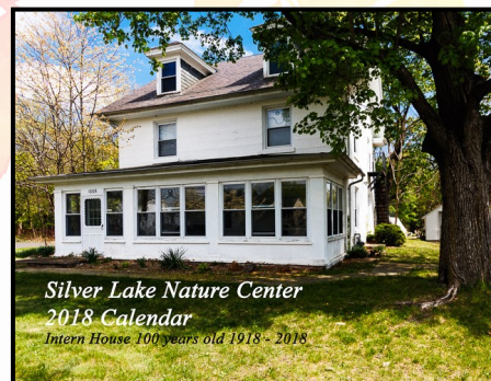
Silver Lake Nature Center 2018 Calendar Intern House 100 years old 1918 - 2018