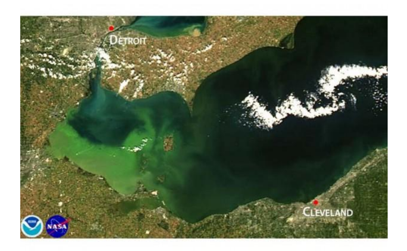
Figure 5: Aerial Photo of Dangerous Algal Bloom in Lake Erie. August 2014

high levels of microsin. This chemical, produced by cyanobacteria, can cause liver failure at high doses (Zimmer 2014).