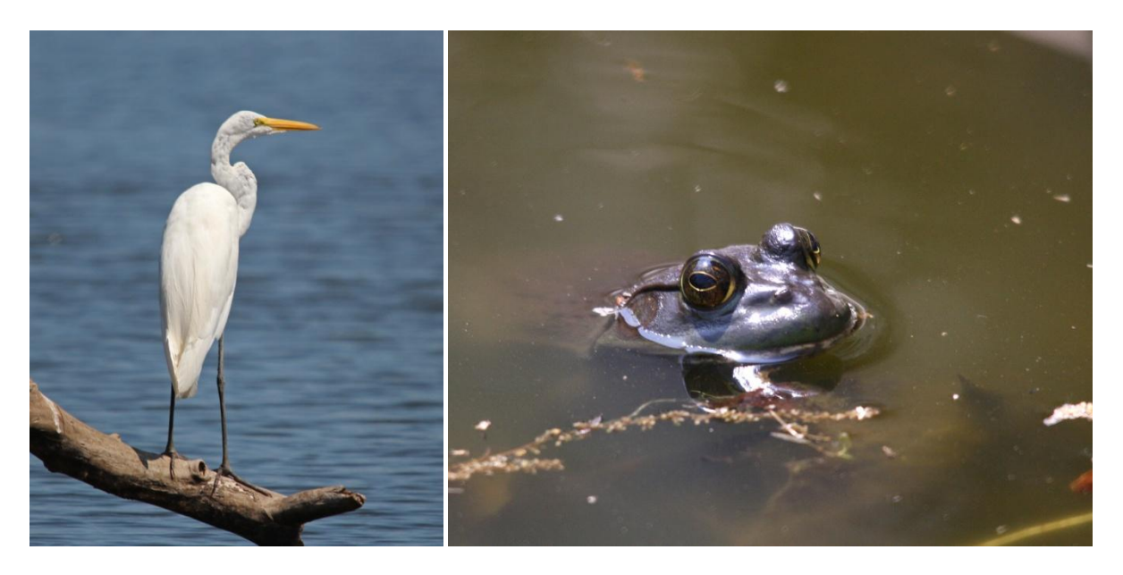
Figure 3: Great Egret

Finally, watersheds are important for the enjoyment of the community. Watersheds offer a wide variety of recreational opportunities including fishing, birding, hiking, and water sports like kayaking and boating. Having quality natural spaces adds value to your life and to your community as a whole. In addition to being a source of entertainment and relaxation, quality watersheds within your community make your community a healthier, more desirable place to live.